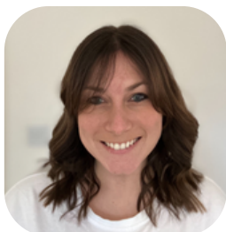
Milly Ballentyne Nurse Fellowship 2025 - 2026