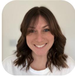
Milly Ballentyne Nurse Fellowship 2025 - 2026