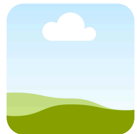
Anna Woodman GP Training Hub Fellow 2026