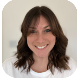
Milly Ballentyne Nurse Fellowship 2025 - 2026