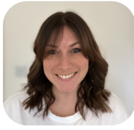
Milly Ballentyne Nurse Fellowship 2025 - 2026